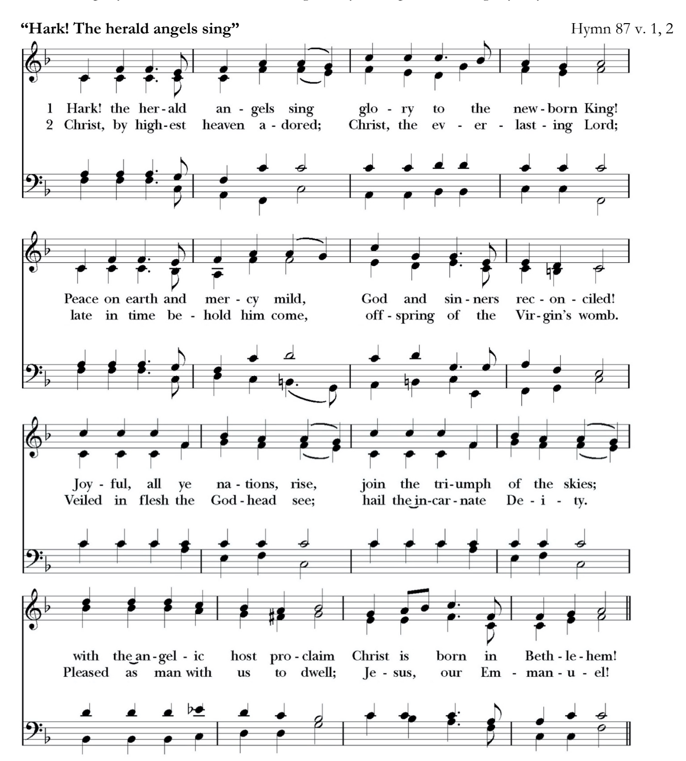
Refrain: Hark! The herald angels sing glory to the newborn King!

Therefore we praise you, joining our voices with Angels and Archangels and with all the company of heaven, who for ever sing this hymn to proclaim the glory of your Name: