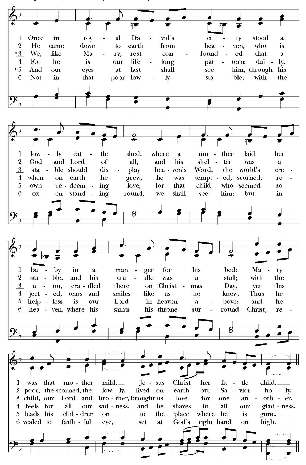
Introit Hymn 102, Once in Royal David's City