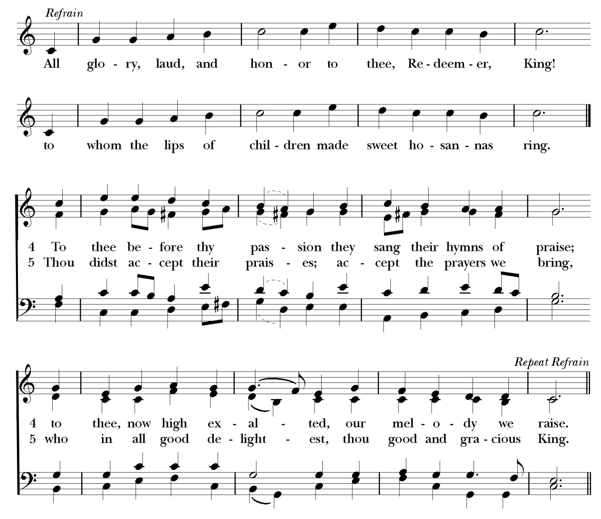
The stanzas may be sung by choir alone or alternately by contrasted groups; all sing the refrain.

Words: Theodulph of Orleans (d. 821); tr. John Mason Neale (1818-1866), alt.