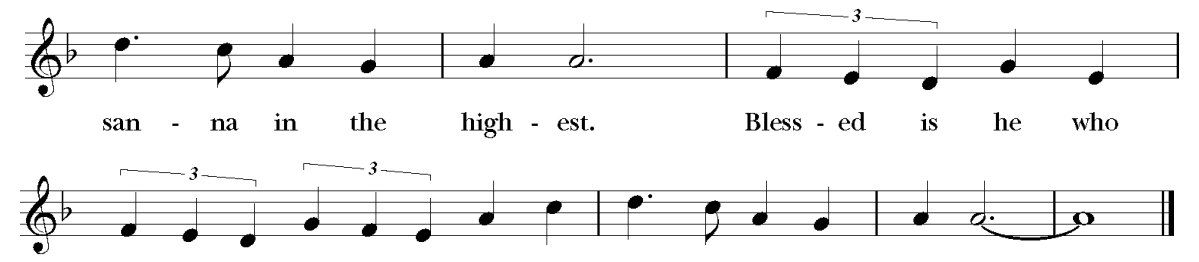
comes in the name of the Lord. Ho - san - na in the high - est.